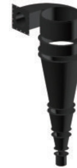
Cyclone Inner Rubber Liner Made of Rubber From Naipu