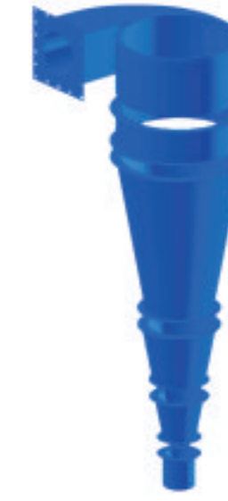
Cyclone Inner Rubber Liners Made of Mixed Rubber From Overseas