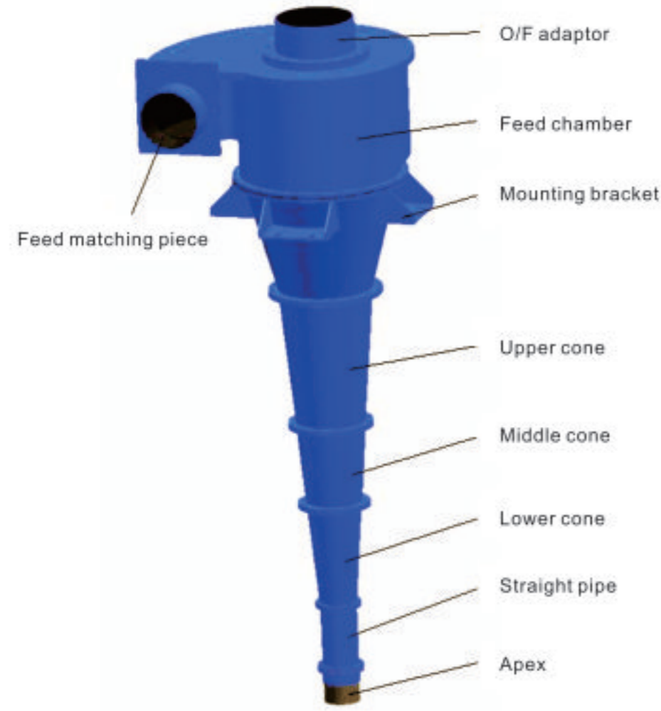
Structure of a Single Cyclone