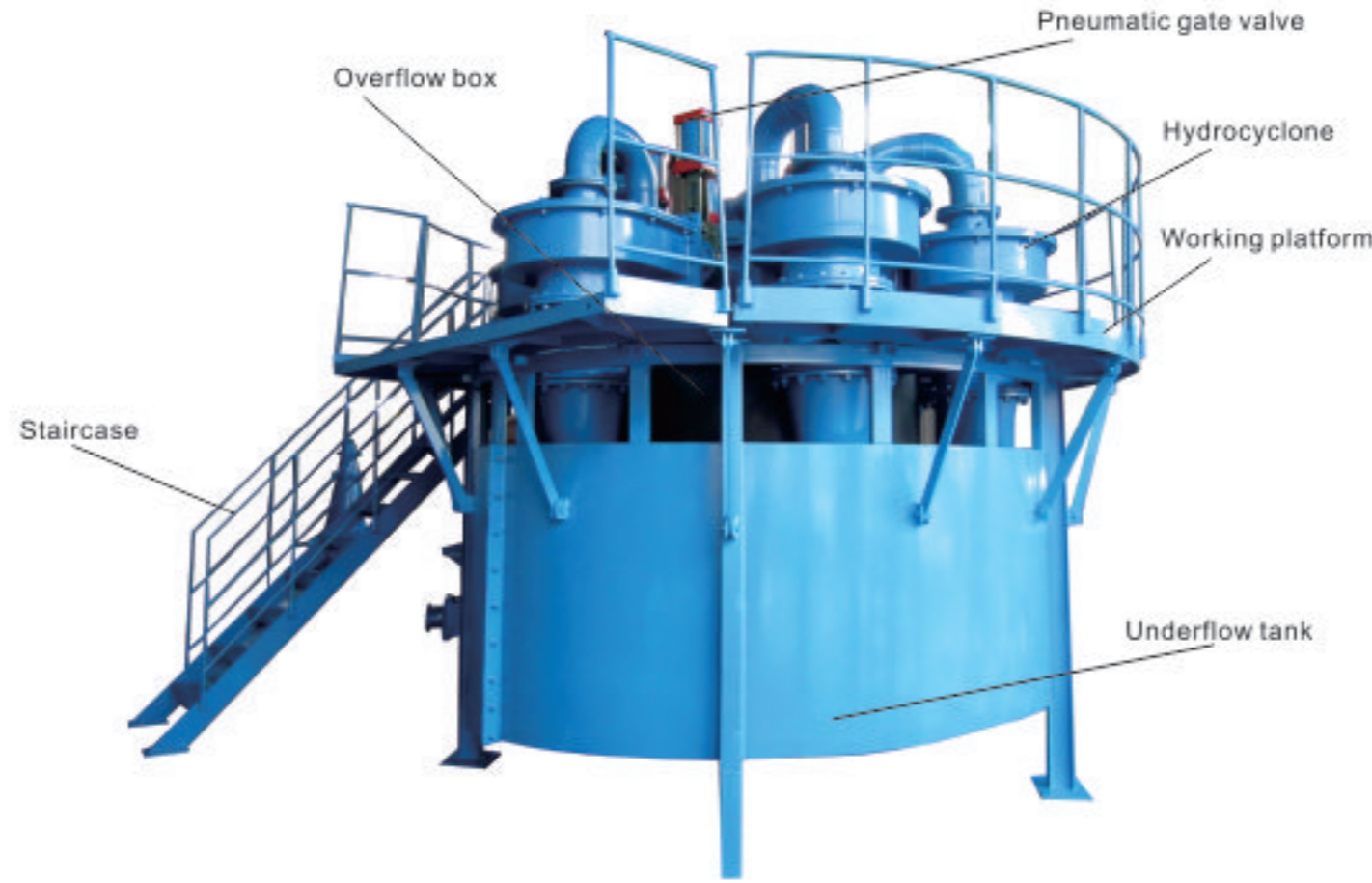
Structure of Cyclone Cluster